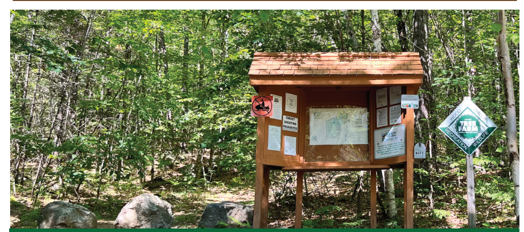
Kiosk at Shawtown Municipal Trail and Mary's Mountain

A PDF version of this trail map is available at the Town of Freedom's website at townoffreedom.net.