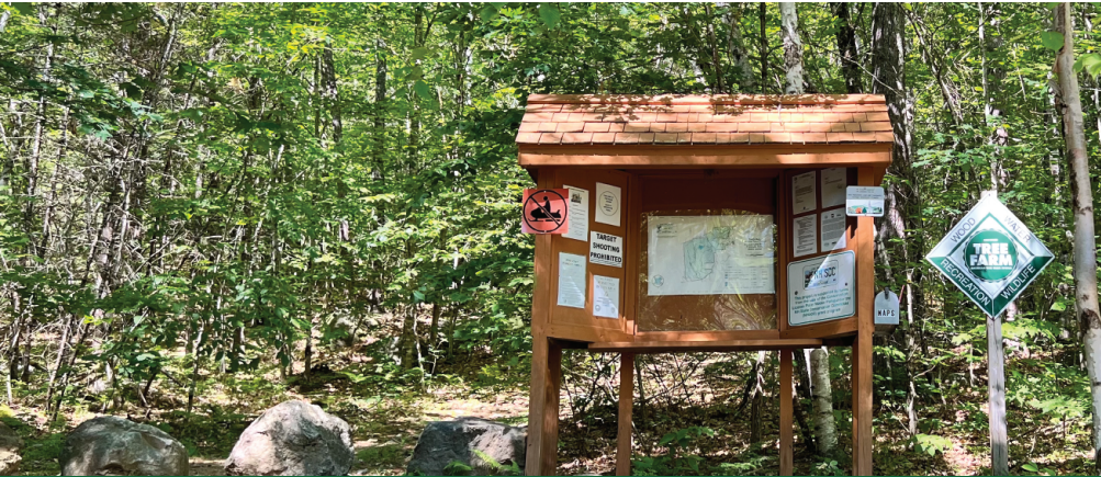
Kiosk at Shawtown Municipal Trail and Mary's Mountain