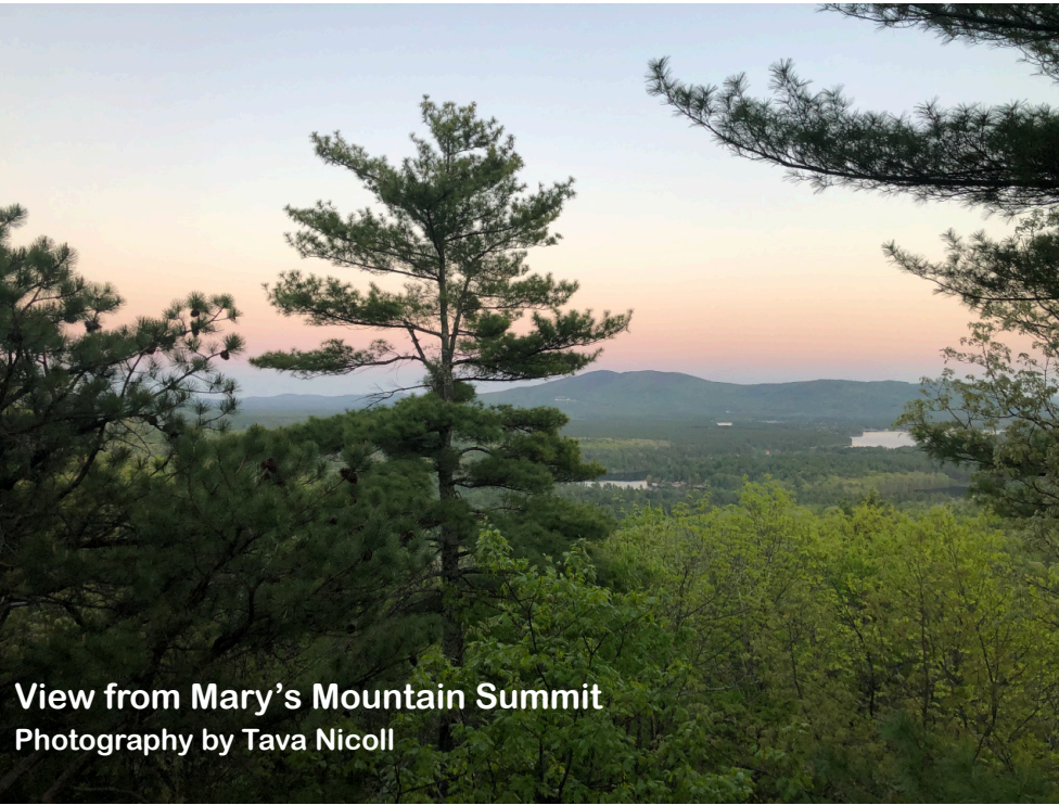
View from Mary's Mountain Summit

Adopted 08/21/07 Per order Town of Freedom, Freedom Conservation Commission RSA 31:112, RSA 41:11. Full ordinance is available at the Town of Freedom website at townoffreedom.net .